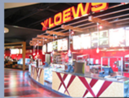
Concession stand and waiting area