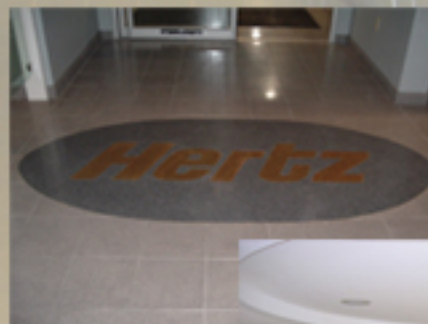
Flooring and ceiling details